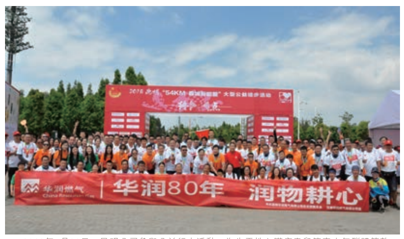
▲ 2018年5月26日,昆明公司參與公益行走活動,為先天性心臟病患兒等青少年群體籌款。 On 26th May, 2018, Kunming Company participated in charity walk activities to raise funds for younger teenagers such as children with congenital heart disease.

On 22nd December, 2018, Qinhuangdao China Resources Gas Co., Ltd. (華潤燃氣秦皇島公司) and Xinghai Parents Mutual Help Association of Mental Difficulty (星海心智障礙家長互助會) helped create a warm and harmonious event for children with autism and mental difficulty, so that more people could pay attention to and care for the group.