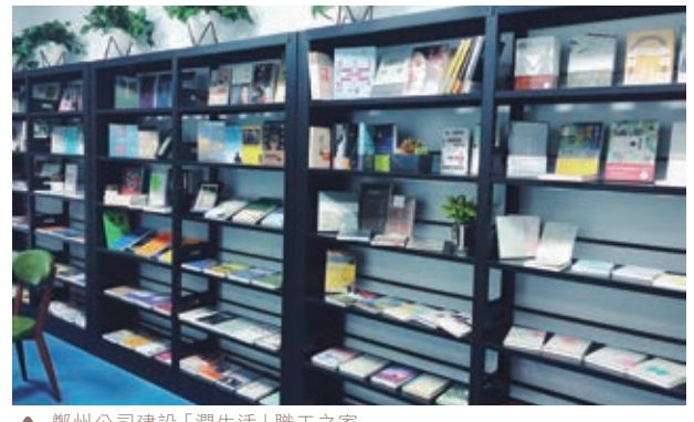
▲ 鄭州公司建設「潤生活」職工之家 Zhengzhou Company created "CR Home" for employees