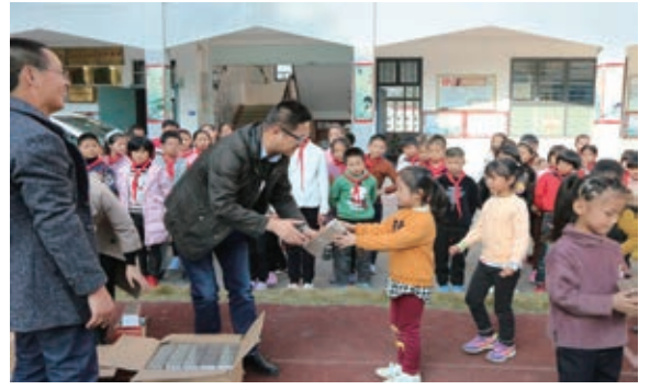
▲ 武義公司結對幫扶困難學子 Wuyi Company paired up to help difficult students

CR Gas provides supports to education and deeply cares about the children in poor areas through donating educational facilities and assisting poverty students to enhance school-running level in poor areas.