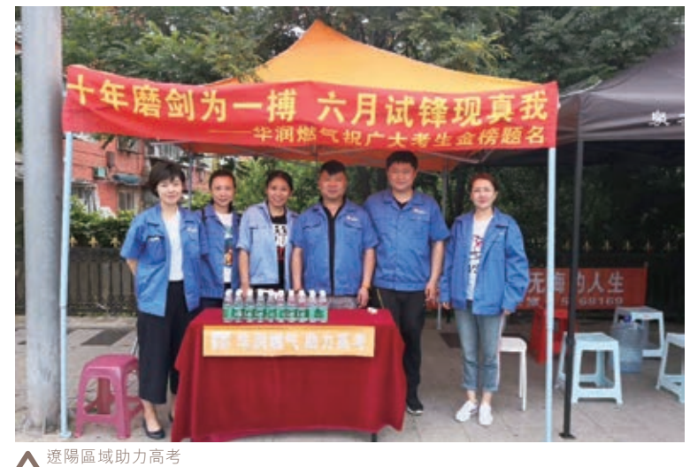
The people in Liaoyang supported students in the college entrance examination period