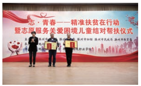
▲滕州公司關愛困境兒童 Tengzhou Company cared for children in difficulty